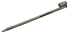
ES-301 Reverse lock on open chuck with NI-102