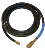
89-HKS Hose for 89MTIS (color coded)